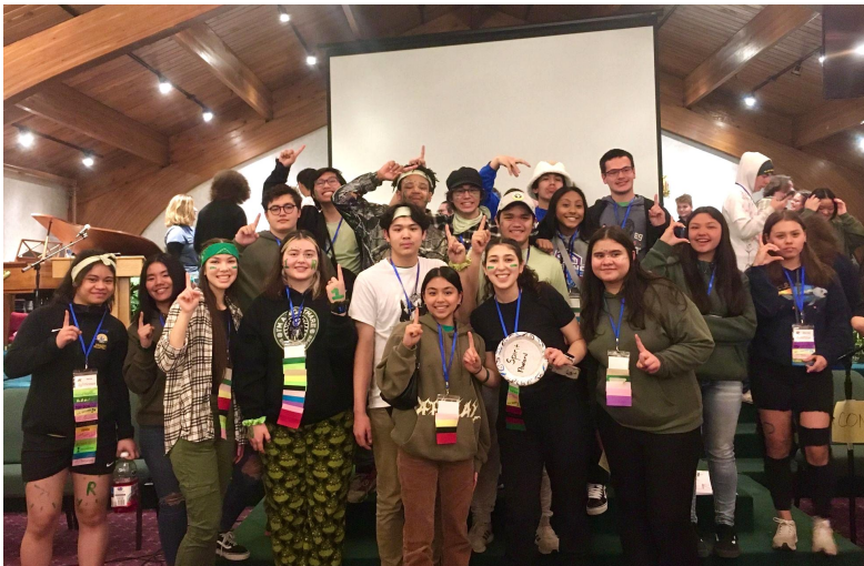
ASAAG students in Kodiak, AK.

For more information on AASG, visit www.aasg.org