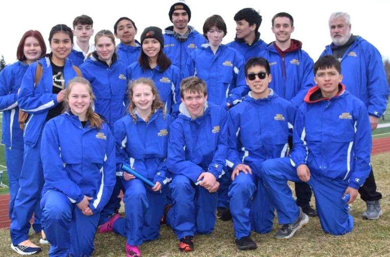
The BRHS Track and Field Team!

This past weekend, the BRHS track and field team traveled to Homer for their first meet, the Bethel Homer Dual and the Homer Invitational.